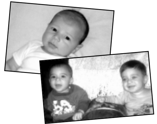
CE/CBR Campers 2013

Campers, Parents, Staff and Alum - Let us know your happy news so we can share it with our camp family.