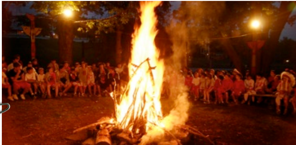
thursday night tribes at ce