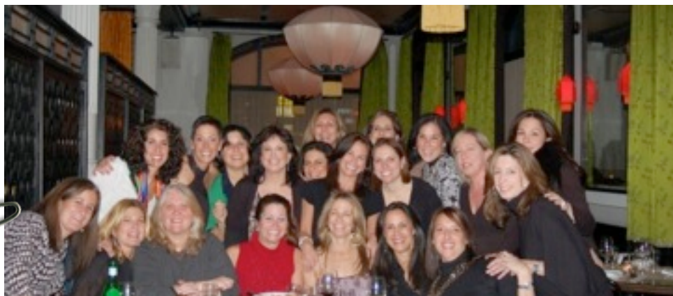
CBR, where friendships really are Everlasting.