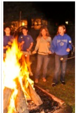
s'mores after cbr tribes