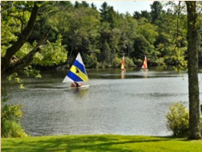
a gentle breeze, sails are up, keels are down, rudders are ready and campers are at the helm.