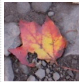
the red and the gray

“splashing waves, leads to subtle ripples, to still reflective waters of summers past and onto cannonballs, dives, and belly flops to come...”