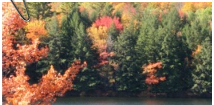
foliage peaks across the northern poconos as seen here on our very own union lake